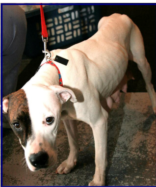
Sugar, shortly after her arrival at Lake Haven

Cats, as well as dogs, should never be left outdoors to fend for themselves. They can suffer frostbite, hypothermia, and exposure to extreme cold could become life-threatening.