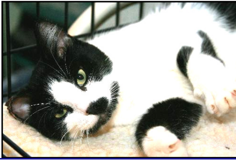
Frosty lost half his tail and ear tip last winter, but not his sweet and loving personality.

Last winter, a caring samaritan found this staving cat begging to come in out of the snow and cold and brought Frosty to Lake Haven. While being bathed, her ear tip came off in our hands. Her ear, as well as half her tail had frozen while she was outside in the cold. Taken in by Lake Haven, she received excellent medical care from Fremont Animal Hospital which included half her tail being amputated. Throughout all her pain and suffering, she remained friendly, loving and as sweet as can be. She was adopted by a wonderful family and today she stays indoors where she’s safe from outdoor hazards.